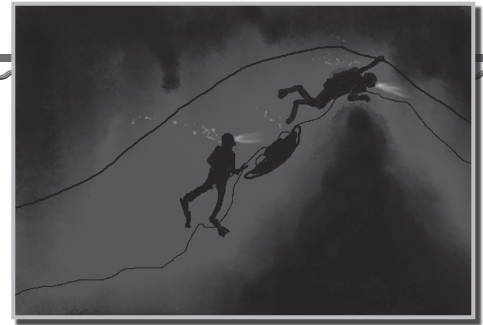
Two rescue divers guide a boy inside a stretcher underwater using a guide rope

The Wild Boars were trapped for 16 days. Rescuers from Thailand and around the world pulled together to save the boys. The Thai commander of the rescue operation summed up this amazing example of teamwork in this way: "It was a mission undertaken by the whole world, by humanity itself."